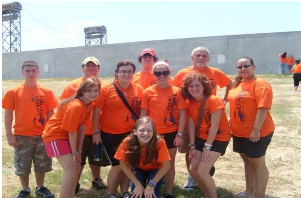
GLC GROUP TOURING THE NINTH WARD DURING THE NATIONAL YOUTH GATHERING

Each day 12,000 of those who participated went to a section of New Orleans or surrounding parishes and participate in some type of community service project. This was the first time that the National Youth Gathering had focused on this type of community service. In all it was estimated that over 250,000 hours of community service was served.