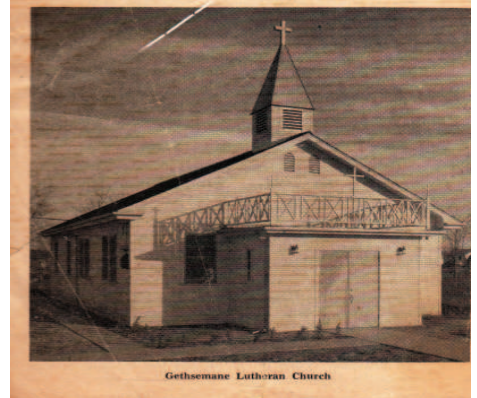
LITTLE WHITE CHURCH