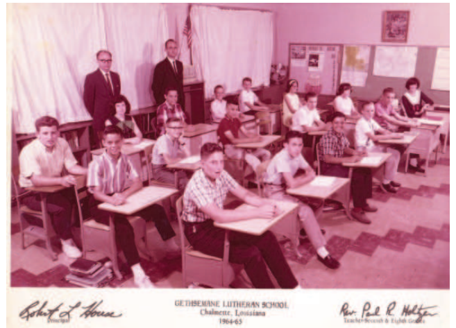
GETHSEMANE LUTHERAN SCHOOL